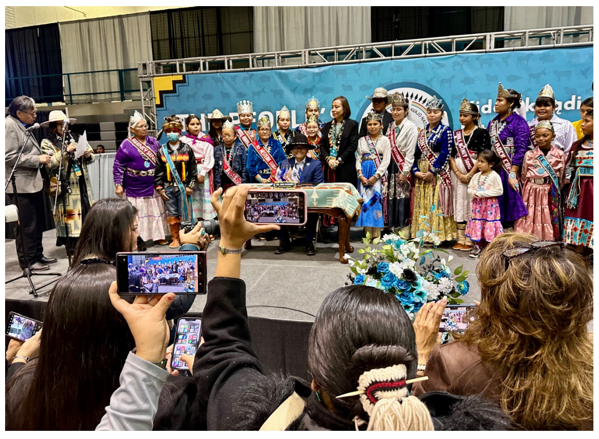
Photographers crowd together to get photos after the signing of the Diné language executive order declaring Navajo the official language of the Navajo Nation.

Renovations for six homes in Shiprock, Rock Point, Lukachukai, Pinon and Dilkon through the BIA HIP program are finished, and seven manufactured homes using ARPA funds have been delivered, with 10 more in progress, he said.